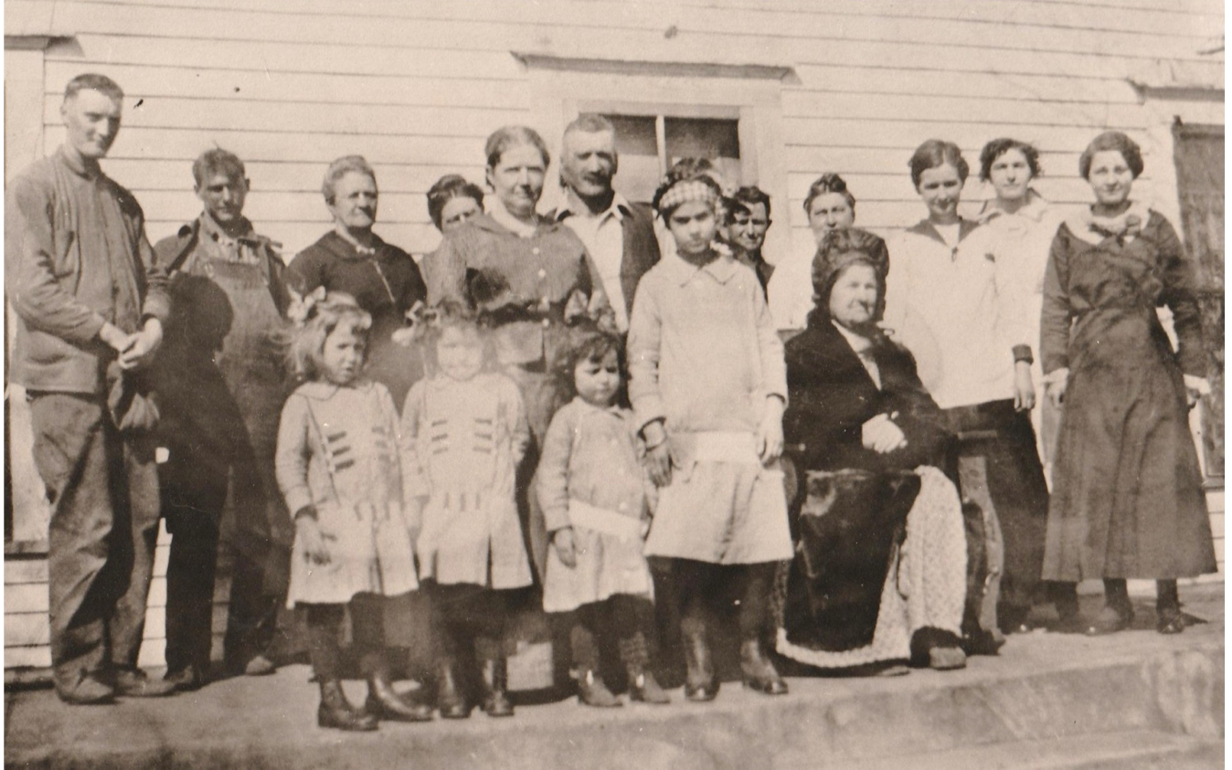
Warffeli Family, ca. 1915