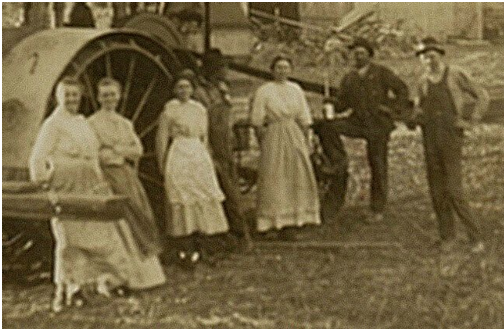
Warffeli farm 1914