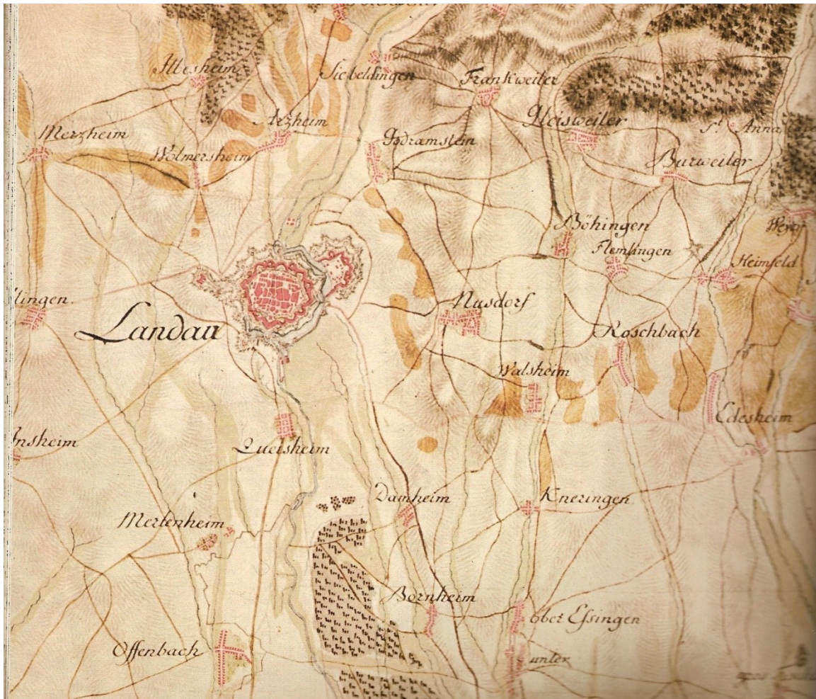
Fortress Landau in 1793

This map, which dates from 1793, shows Landau, with its walls and fortifications. Note that the directions are rotated (south is on the left side of the map). Insheim is southeast of Landau. Rohrbach is not shown in this map.