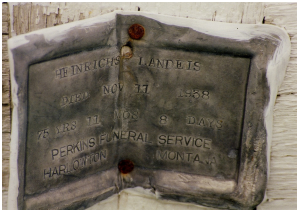
Grave marker Resurrection Cemetery, Ryegate, MT Heinrichs Landeis, Died Nov. 11, 1938