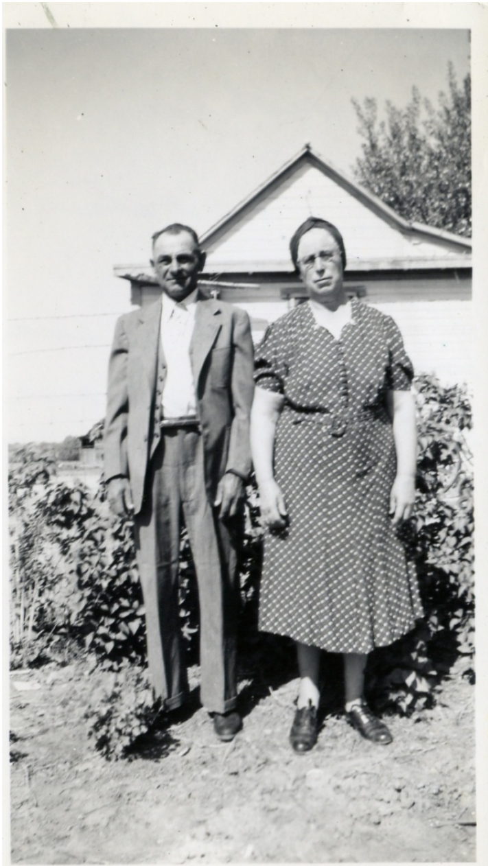
Grandpa and Grandma as I remember them