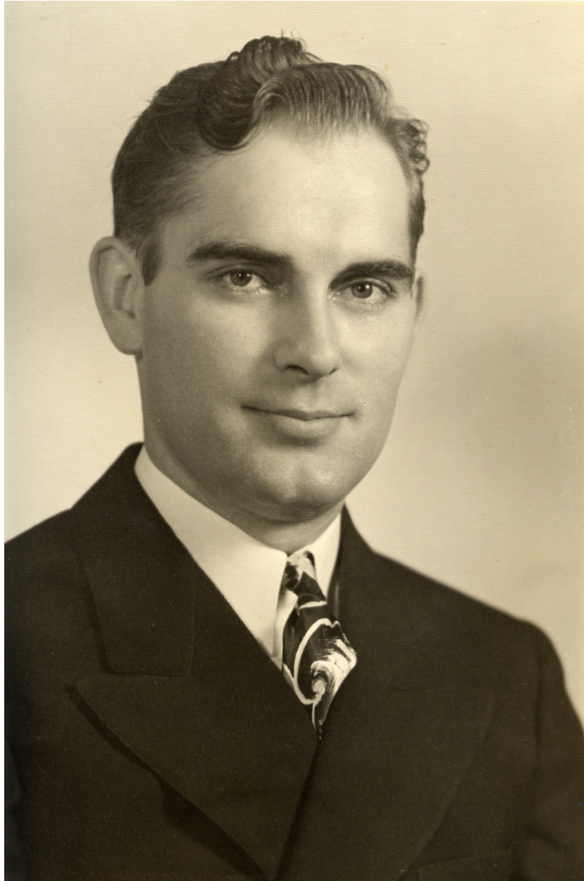
Al age 29