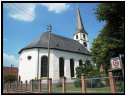
The Protestant Church in Hochstadt, Germany - 1739, the original home of the Ehlys.

The Schoolmaster's Report lists a number of people coming from Alsace and none from the Pfalz, but the census of 1816 indicates that a number of individuals came from the Pfalz. This confusion is the result of France having annexed the Pfalz west of the Rhine River prior to 1809; it was considered French territory. Then, too, the villages from which these immigrants came are within 30 to 40 miles of the current Alsace French border.