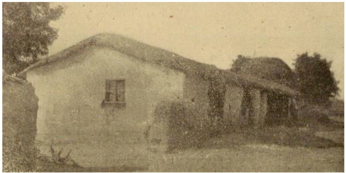
Old School House in Sofular

government department ( Ministerium ), which made it possible for them to build homes again. Only one German stayed on his old farmyard and built his house and stables at the higher end. The water disappeared only after eight long weeks. The events of this disaster will stay for a long time in the memory of all those who had to go through this difficult time. A few only had daily bread until the next harvest. The vast majority, both Germans and Romanians, earned their living by breaking up rocks in the quarries nearby the village. The Sofular rocks are valued as good building material and sought after by all the surrounding villages.