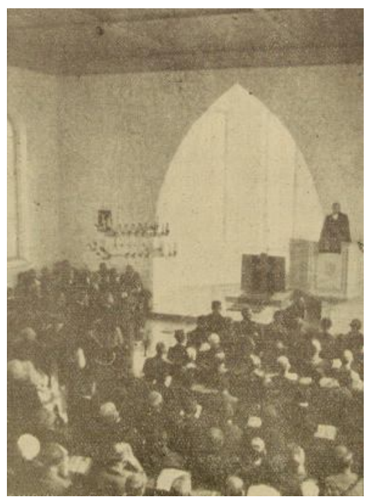
Pastor Erich Darsow preaching at the Dedication Day Celebration on 14 October, 1928

The new spacious church is still without an organ, which now cannot be purchased because of the severe economic conditions, and so the old pump organ ( Harmonium ) must do its service. A mixed choir contributes its part to the embellishment of the worship service on festival days