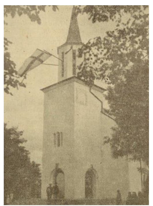
Ev. Luth. Church at Tariverde, built in 1928, with church banner and sundial on the steeple.

A plain, picturesque little church, a modest farmhouse with a cane roof and a wide, wooden bell tower erected by it, stood for a few years in the middle of the village, half hidden in the greenery of the trees. This old building from 1886—on the occasion of the 50<sup>th</sup> anniversary of the