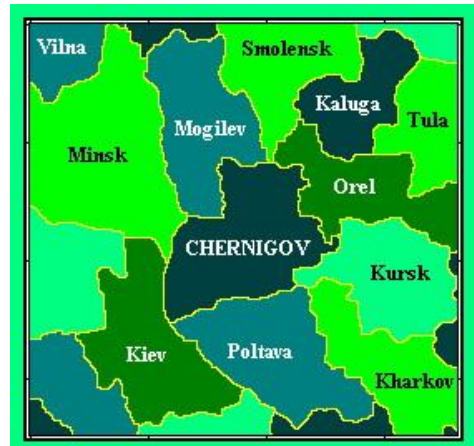
Russian Empire : Gubernias 1882