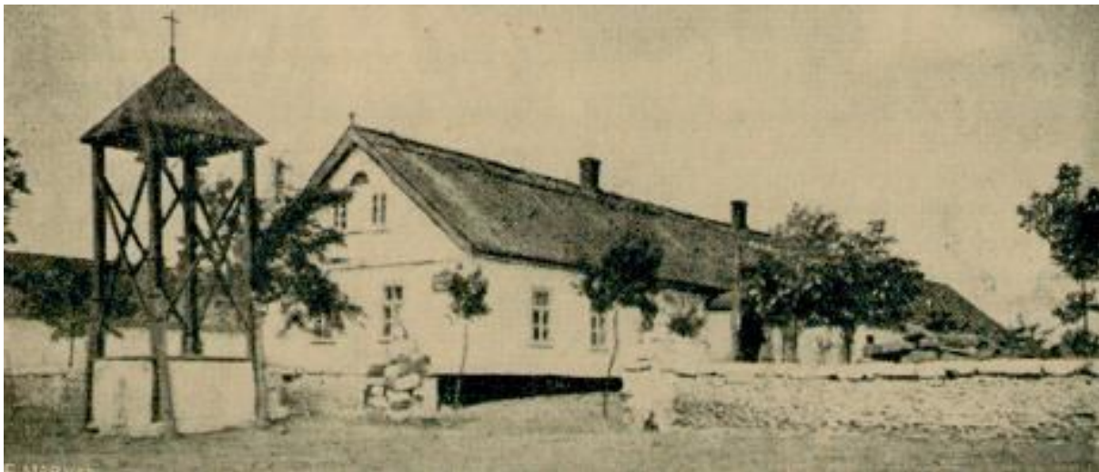
Pawlowka School and Prayer House

On Sunday afternoon, all gathered somewhere and in the winter the room set aside for spinning could never accommodate all who came together for these gatherings, which one called “ Mayen ” [*]. At these gatherings, there was always such a good mood, happy entertainment, humor and