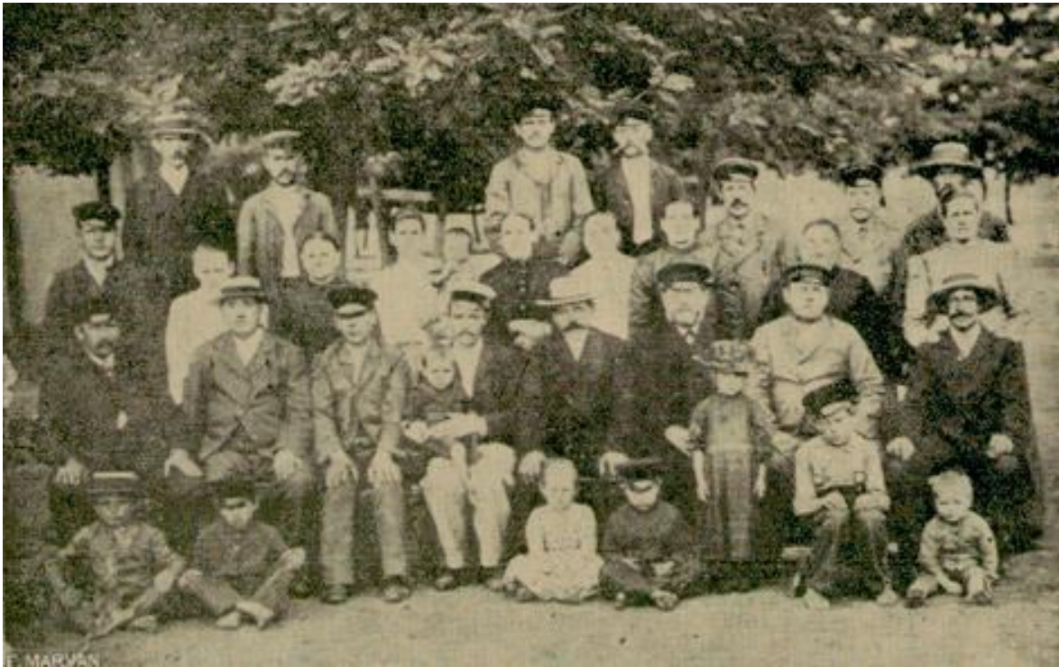
Founders of Pawlowka and their Families