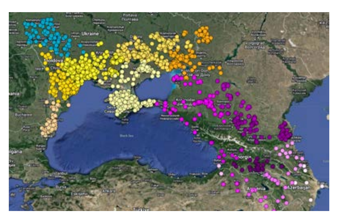
Germans from Russia Settlement Locations map of the Black Sea region